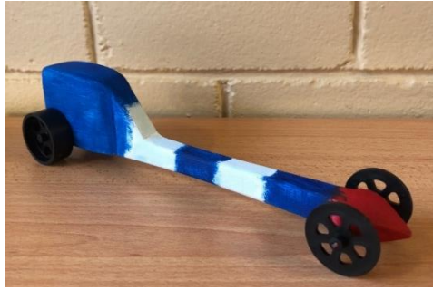
Winner of the Fastest CO2 Dragster: Kieran 1.198sec over 20m