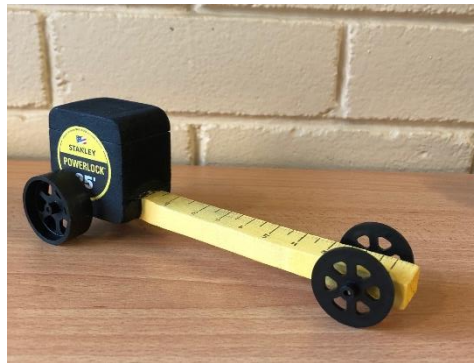
Winner of the Student Choice Show'n'Shine: Amity (Tape Measure)