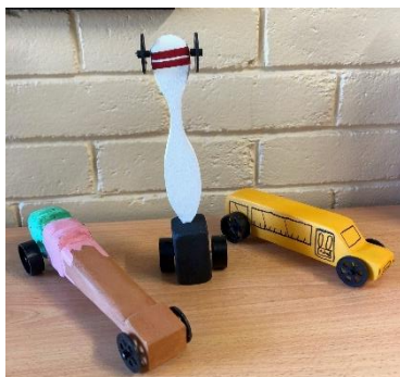
Some of the other creative entries: Ice Cream - Nikita, Bowling Pin - Claire School Bus - Klancie