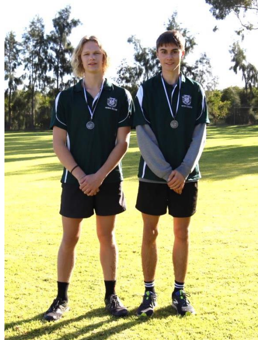
Winners Open Boys Cross Country