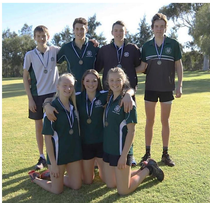
Winners U15 & 16 Cross Country